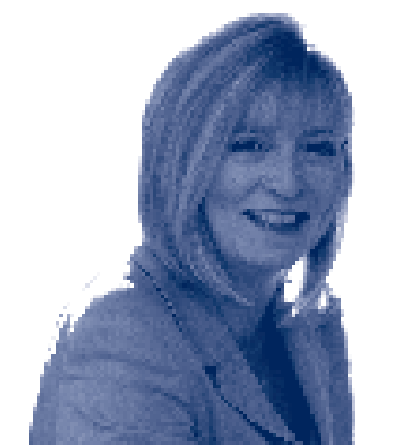
Emily O'Reilly Ombudsman